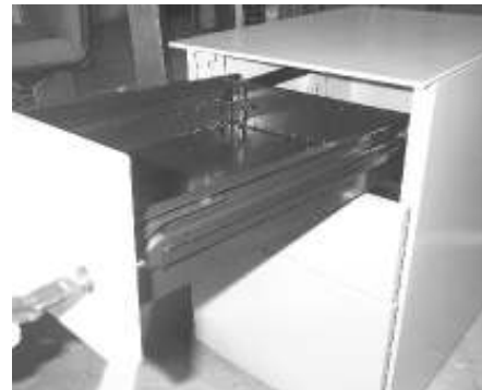
Push the drawer home, and test the drawer is functioning correctly. (Make sure lock pin has dropped, and sits on top of the side ledge of the drawer, otherwise the drawer may not close, or function correctly)