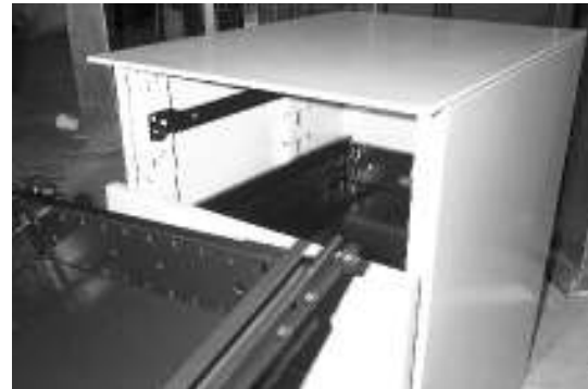
Pull the drawer away from the cabinet. (Take care to support the weight of the drawer)

DRAWER FITTING: Make sure the drawer is empty: