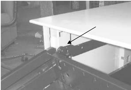
The motion requires the slide wheel attached to the drawer, to rise over the slide wheel attached to the cabinet.